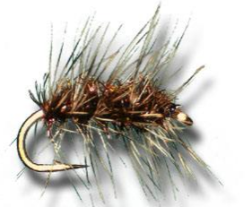
Griffith's Gnat 18 - 20

If you can, try to get 2 or 3 flies in each size. I understand that's a lot of flies, but trees, rocks and friends always seem to take a couple when the fish are biting.