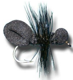
Foam Ant Size 18 - 20