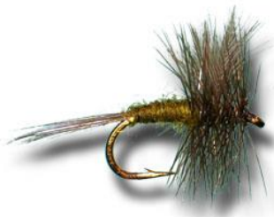
Blue Wing Olive Size 14 - 18

If you can, try to get 2 or 3 flies in each size. I understand that's a lot of flies, but trees, rocks and friends always seem to take a couple when the fish are biting.