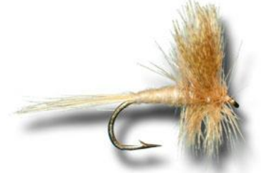
Light Cahill Size 14 - 18