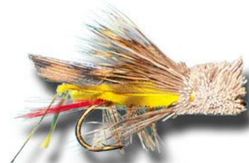
Dave's Hopper Size 8 - 10