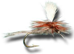
Parachute Adams Size 14 - 18