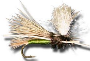
Olive Madam X Size 8 - 10