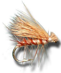
Elk Hair Caddis 14 - 18